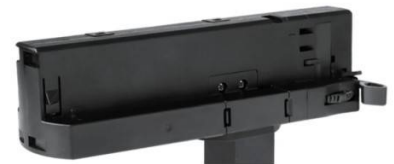
4 Wire (3-Phase) Rail