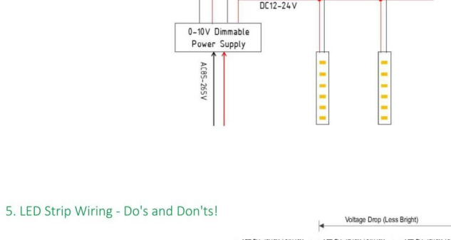
3.Wiring example for projects - 24VDC