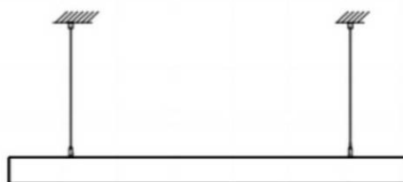
4.Adjust the position of the fixture and clean it.